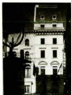
ALTERATION AWARD for 1986 The Episcopal School at 35 East 69th Street.