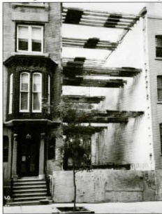
Joists are all that remain of the former Dvorak house at 327 East 17th Street.

The City Council hearings on affirmation of the Landmarks Preservation Commission's designation of the Tribeca West Historic District (TWHD) brought out the faithful in July and August. The district, designated in May of this year after a seven-year effort, came under intense fire from the Real Estate Board of New York over the summer. The Real Estate Board proposed their own version of the historic district that effectively cut the size of the LPC-designated district in half. In testimony before the City Council on August 12, FRIENDS questioned the Real Estate Board's motives and its "ability to put forth a more objective opinion on the district boundaries than the LPC and the City Planning Commission," the latter having