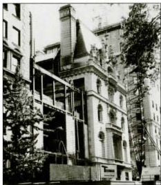
Renovation and expansion in progress at the Jewish Museum, at Fifth Avenue and 92nd Street.