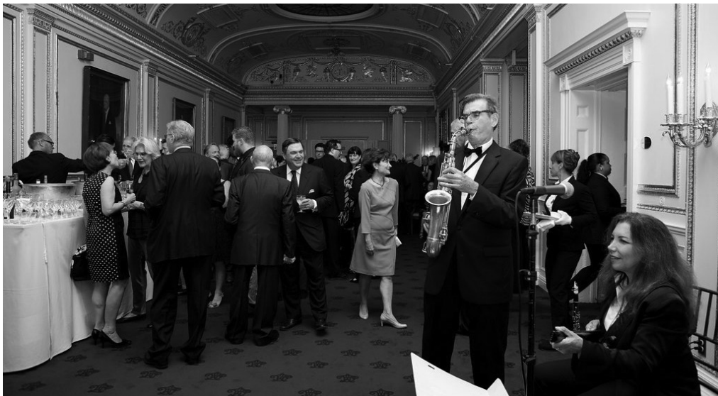
Guests enjoyed cocktails at the Metropolitan Club.