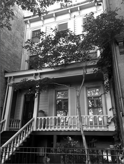
412 East 85th Street

Supporters of wooden houses citywide showed up at the Landmarks Preservation Commission's special hearing on November 12, 2015 to speak in favor of the designation of 412 East 85th Street as an individual landmark. The house was built circa 1860 and is a rare example of a wooden clapboard building in Yorkville, a remnant from the area's agrarian past. It is one of only six wood frame houses on the Upper East Side, and the only one which remains unprotected. Its owners have been careful stewards of the building, restoring it to its 1916 appearance based on the earliest and most com-