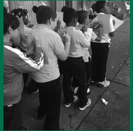
Students at PS 50 sketching in East Harlem during their Landmarks & Preservation walking tour.