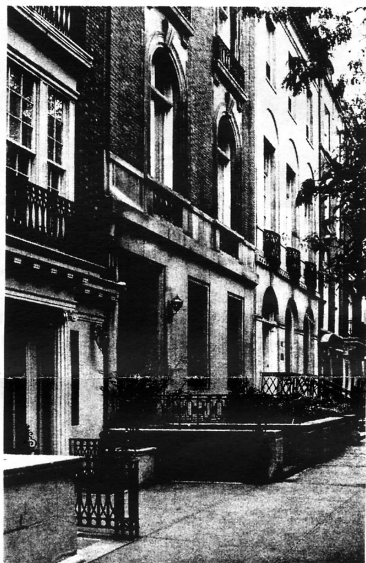
111-121 East 70th Street