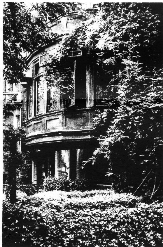
129 East 70th Street