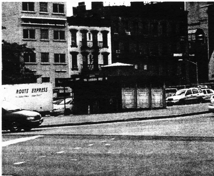
The trolley kiosk today, unprotected and damaged by repeated auto strikes.

The New York City Department of Transportation (DOT) has applied to the Landmarks Preservation Commission (LPC) to dismantle and store the structure, which FRIENDS believes is akin to demolishing it. To stop this misguided plan, FRIENDS has joined forces with the Municipal Art Society's Urbanists—a group of young design professionals—to save the structure and bring it a new life.