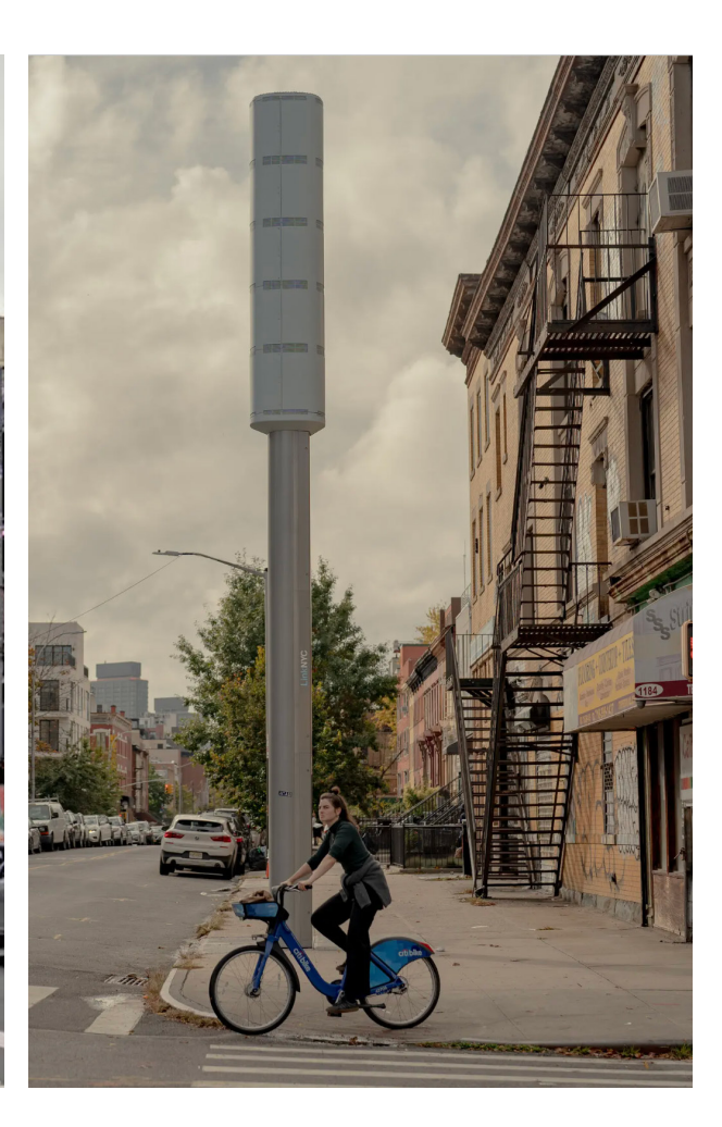
\label{lem:left-to-Right: CityBridge Link5G Towers in Chinatown and Bed-Stuy.

In 2022, the New York City Office of Technology and Innovation (OTI) announced its plan to install LinkNYC kiosks equipped with 3-story 5G antennas throughout the city. Termed the Link5G Tower Program, this initiative, facilitated by a consortium of private telecom companies called CityBridge, promised to boost wireless technology accessibility. However, the program's limited public review and its potential impact on historic and public spaces has raised many concerns.