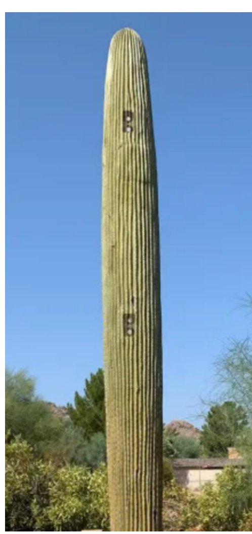
Left to Right: Comptek Technologies proposed 5G tower for historic districts; 5G equipment concealed on a church steeple; Faux cacti for 5G connectivity equipment in Arizona.

greater scrutiny of the LinkNYC program's impact on public spaces, especially in historic districts. In response to concerns raised by advocacy efforts, stakeholders, and elected officials like Congressman Jerrold Nadler, the proposed 32-foot tall Link5G towers were subjected to the Section 106 review, mandated by the National Historic Preservation Act. This process assesses the potential adverse effects on historic properties arising from projects funded, licensed, or approved by Federal agencies, highlighting the significance of the impact these towers may have on historic spaces.