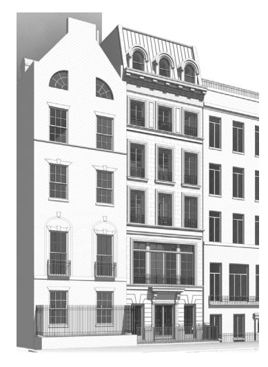
Left to Right: View of 105 East 64th Street, 2022; 1927 view of East 64th Street, showing original row at Nos. 103-112; Existing and proposed (Workshop Design + Architecture, June 28, 2022 LPC hearing).

because of the "no-style" designation, the LPC approved a proposal to demolish the building and replace it with a new building. Similarly, the LPC approved the demolition of an altered rowhouse at 105 East 64th Street and its replacement with a disproportionately tall building, despite the fact that the new building would disrupt the rhythm of the remaining row with floor heights that would not align and much larger window proportions that would disrupt the legibility of the historic row. The discussions during these cases underscored the urgent need to revisit the current regulatory practices and develop a standardized approach that prioritizes public participation and historical preservation.