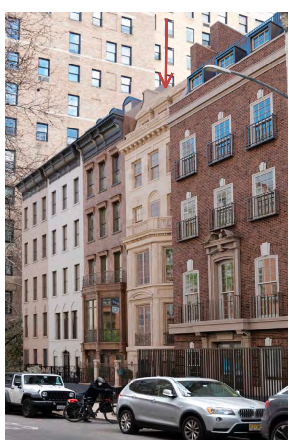
Left to Right: View of 38 East 75th Street, 2022; Arrow points to building facade altered in 1926, part of an original row of four buildings; Street view with proposed new facade (via Robert A.M. Stern Architects, LPC hearing materials May 3, 2022)

Tucked in between the distinctive brownstones, apartment houses, and stately townhomes of the Upper East Side Historic District, with their characteristic Beaux-Arts, or Neo-Gothic, or Art Deco facades, there is a distinct category of buildings that do not at first glance conform to a particular architectural style or movement. Labeled "no-style" buildings by the city's Landmarks Preservation Commission, these structures, which include townhomes with simplified facades and minimal ornamentation, or boxy apartment houses in different scales. are treated differently from other buildings within the historic district, categorized "non-contributing" to the district and therefore without the protections the LPC normally confers to buildings within its special preservation areas.